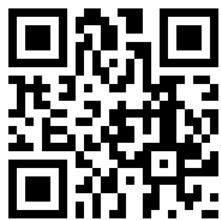
News & Events

Scan these QR codes to learn about these events (and more) and to give online. (Open your phone's camera and point it at the codes)